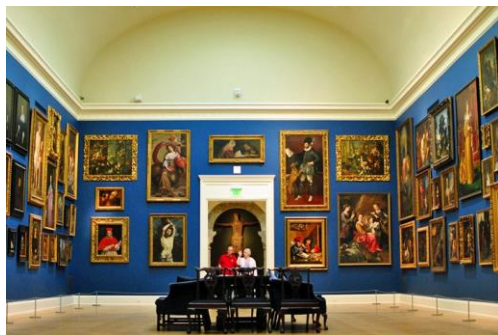
RISD Museum of Art